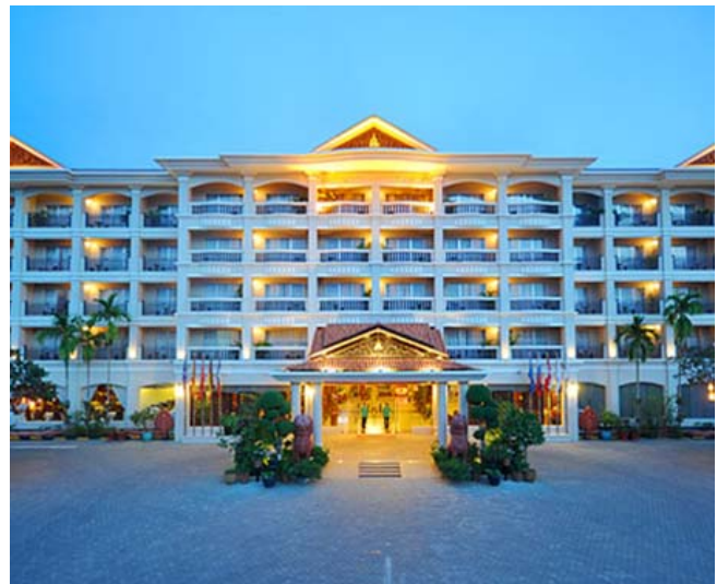
Façade of Soma Devi Angkor Hotel

After visiting several international standard hotels such as Sokha Resort Hotel, Lucky Angkor Hotel, Soma Devi Angkor Hotel, Angkor Lang and Prince d'Angkor Hotel, we have decided to choose Soma Devi Angkor Hotel as our National workshop venue on the community-based inventorying of intangible cultural heritage, 14-21 February 2013 in Siem Reap, Cambodia. This hotel is the most appropriate venue for our workshop in terms of price, location and good environment for participants and