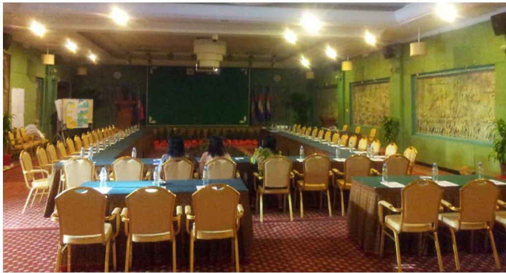
workshop room, Soma Devi Angkor Hotel