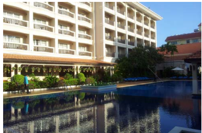
Break areas and outside of the workshop room, Soma Devi Angkor Hotel