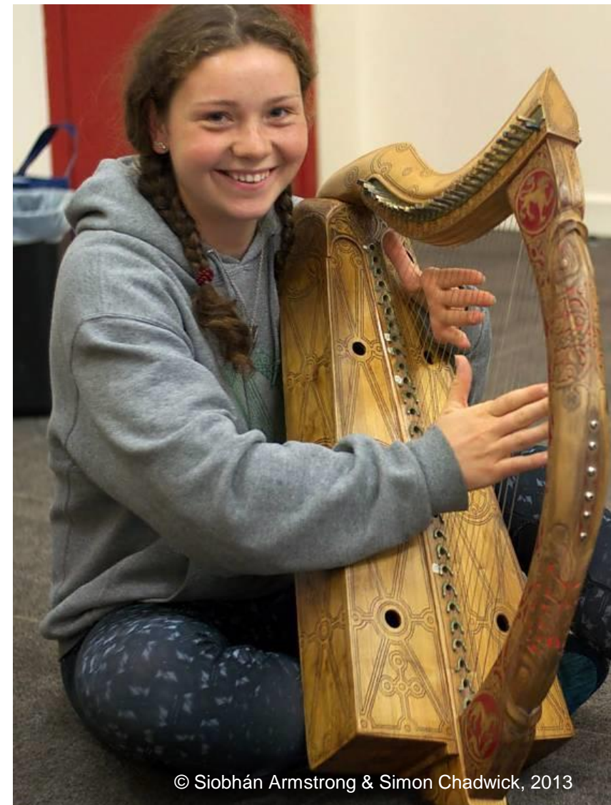
© Siobhán Armstrong & Simon Chadwick, 2013

For more information on the guidance notes, you may consult the dedicated webpage