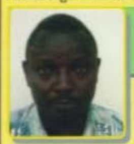
EZT General Secretary