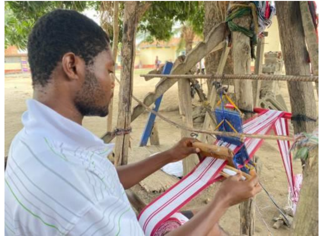
© National Folklore Board, Ghana, 2023