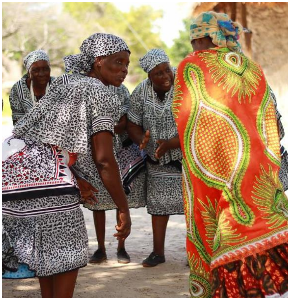
© Ishmael Ogaufi Otladisa and Veekuhane, Botswana, 2018