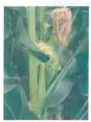
Pic. No.1. Green maize in the garden