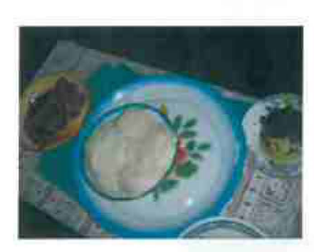
Pic. No.6: Ubughali/Nsima and accompaniments