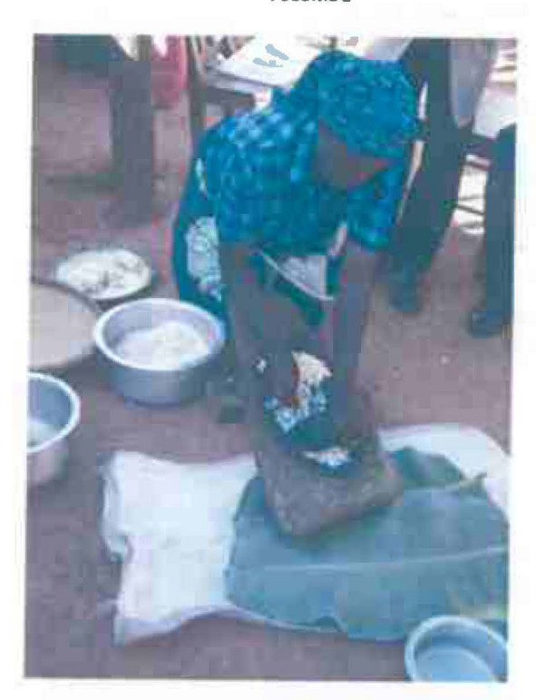
September 2012 - April 2013