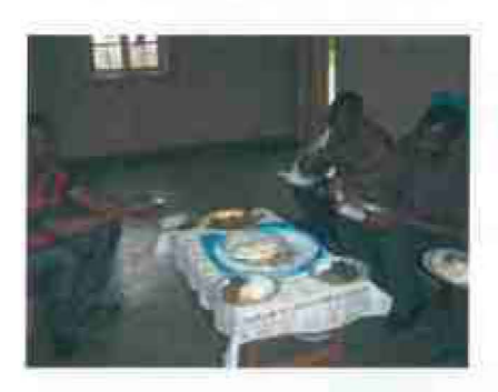
Pic. No.7: Eating Ubughali/Nsima is a communal tradition