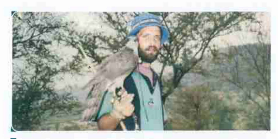
Falconry is Family Heritage Learned Through Generations