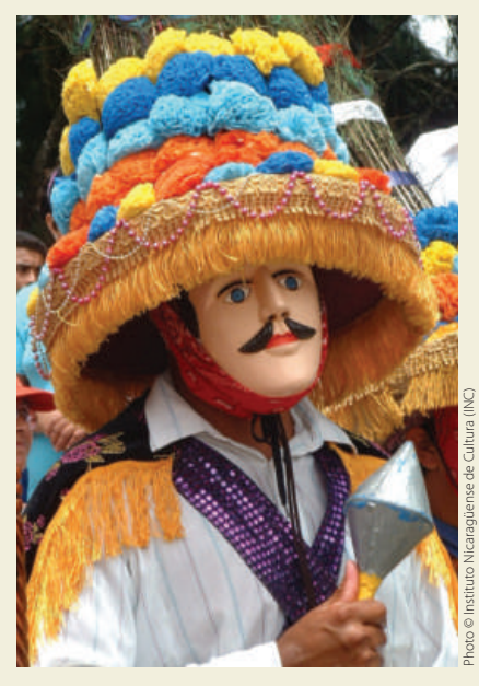
♠ El Güegüense, Nicaragua

The Cultural Space of the Boysun District, Uzbekistan