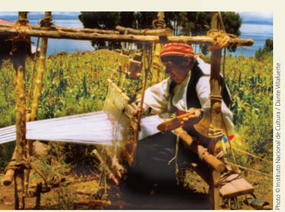
• Taquila and its Textile Art, Peru

១១១១ Language, Dance and Music of the Garifuna, Belize, Guatemala, Honduras and Nicaragua