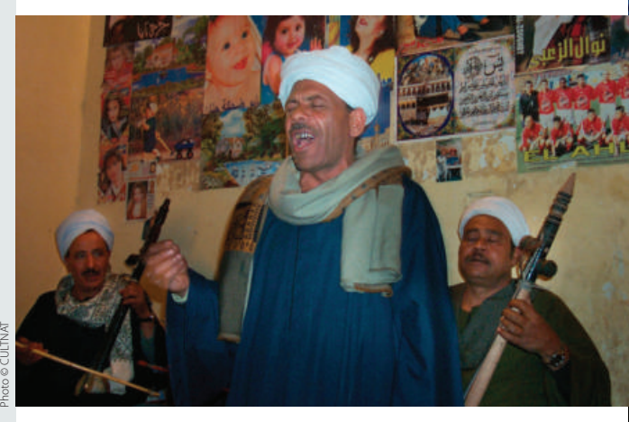
• The Al-Sirah Al-Hilaliyyah Epic, Egypt

In order to safeguard intangible cultural heritage, we need different measures from the ones used for conserving monuments, sites and natural spaces. For intangible to be kept alive, it must remain relevant to a culture and be regularly practised and learned within communities and between generations.