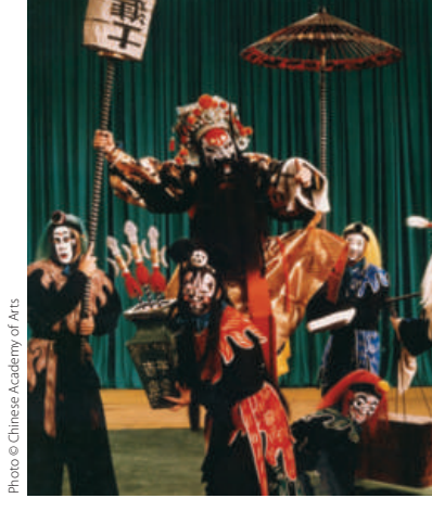
• Kun Qu Opera, China • The Ahellil of Gouara, Algeria

• The Bistritsa Babi – Archaic Polyphony, Dances and Rituals from the Shoplouk Region, Bulgaria